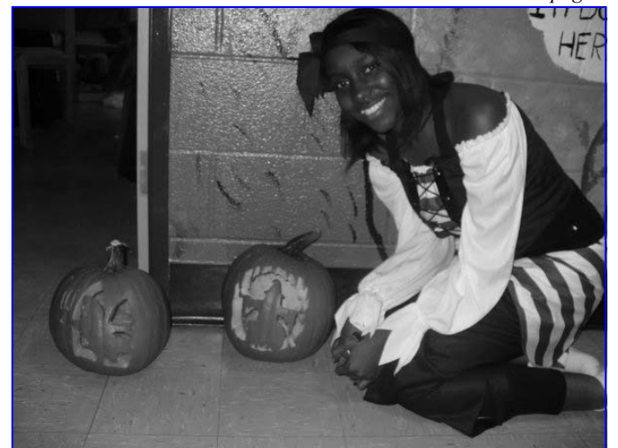
Pumpkin carving.