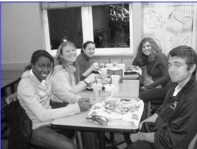
Students from campus ministry at TCNJ.

Campus ministry is a ministry of presence. After a short three months at TCNJ, our presence is beginning to be felt and we are establishing both name and face recognition among the students and with the faculty and staff. We are also having fun and growing in understanding and faith as we experience the presence of the Holy Spirit within us and among us.