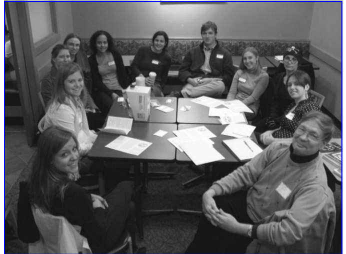
A gathering of the Princeton "Theology on Tap."

Are you a young adult on Facebook? Join the New Jersey Young Adults Facebook group.