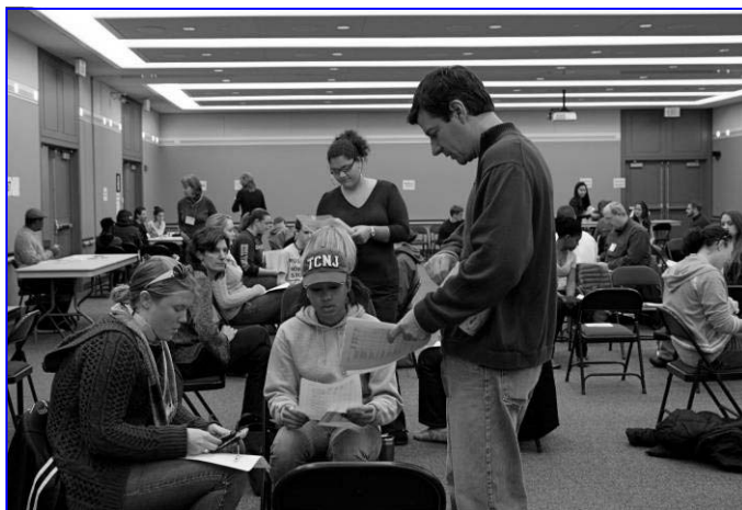
TCNJ Poverty Simulation.