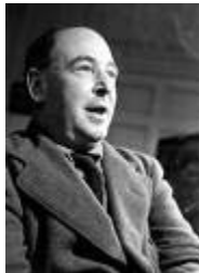
C.S. Lewis book group at Canterbury House, Rutgers.

Looking for a way to draw young adults into your parish and engage them theologically? Enter through the wardrobe into Narnia with C. S. Lewis, the best-known and best-loved Anglican author. Students, staff, and faculty from a variety of backgrounds meet on alternating Mondays around the fireplace at Canterbury House on the New Brunswick campus of Rutgers University to discuss theology based on the writings of Lewis and other authors. The spring 2009 reading list will include The Screwtape Letters , advice by a senior devil to his nephew Wormwood.