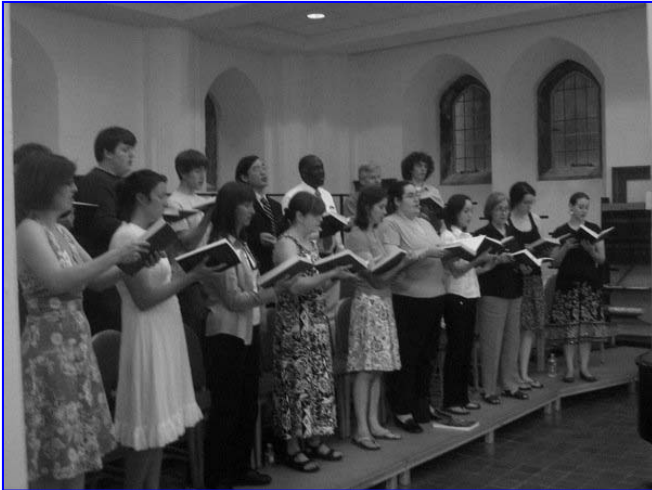
Members of Lux, the choir of the Episcopal Church at Princeton University, rehearsing in the crypt of Princeton University Chapel.